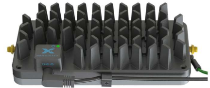
CEL-FI ROAM R41

UNIFIED BUSINESS NETWORKING & TECHNOLOGY Smarter Affordable Networking for Australia!